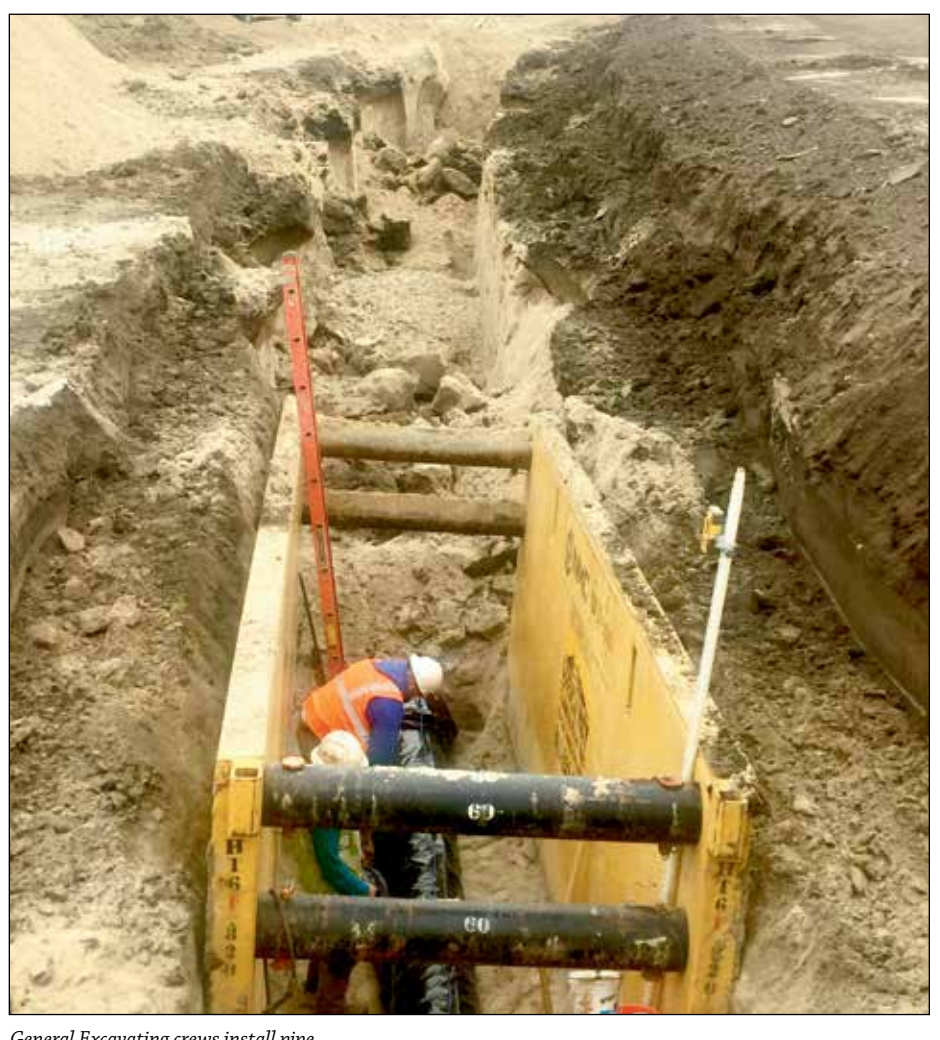
General Excavating crews install pipe.

Kolterman explains the automation will replace positions that are hard to fill and have a higher turnover rate. The facility will process whole broilers and boneless breasts, thighs, drumsticks and other chicken products.